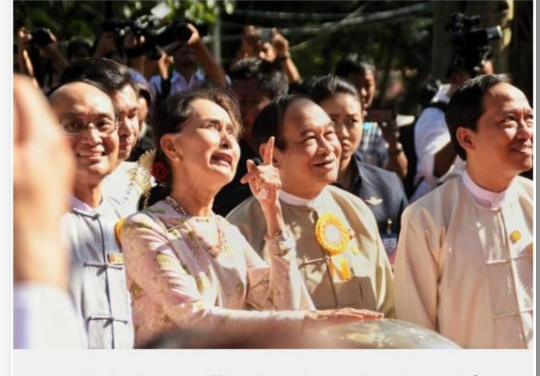
State Counsellor Daw Aung San Suu Kyi attends Medical Skill, Simulation and Research Center in Yangon