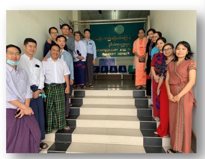
Figure 1. HBP family