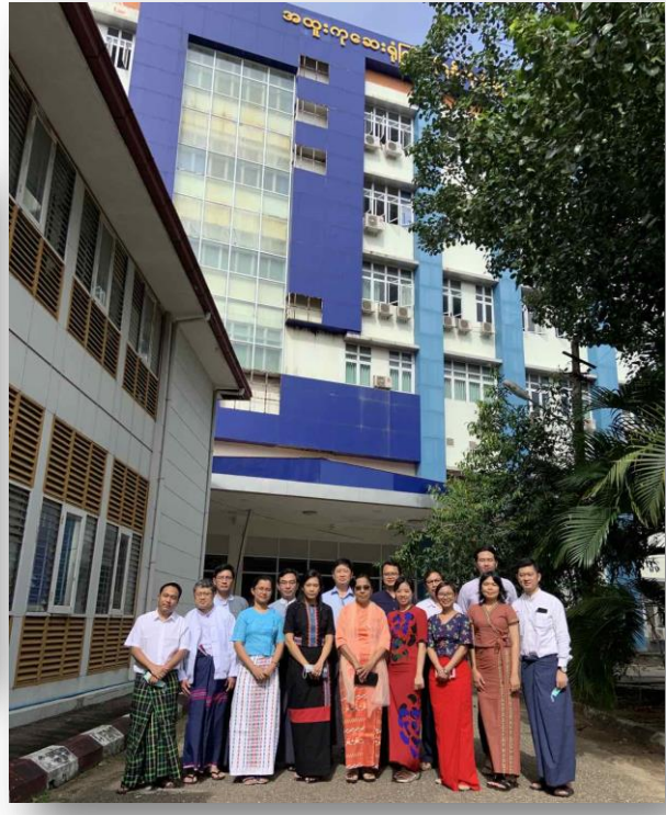
Figure 2. HBP family

We have been making dots like Korea-Myanmar transplant collaboration, multidisciplinary group training or fellow training to high volume centers. Moreover, doing practices in silent mentor or animal workshops are steps to get to our destination.