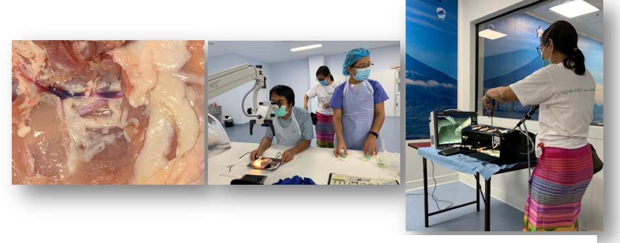
Figure 6,7 and 8. Practices in Medical Skill, Simulation and Research Center

As cumulative outcomes of these practices, previous fellow trainings and live demonstrations, we can extend our operative criteria in cholangio-carcinoma and perform laparoscopic HBP surgeries more confidently.